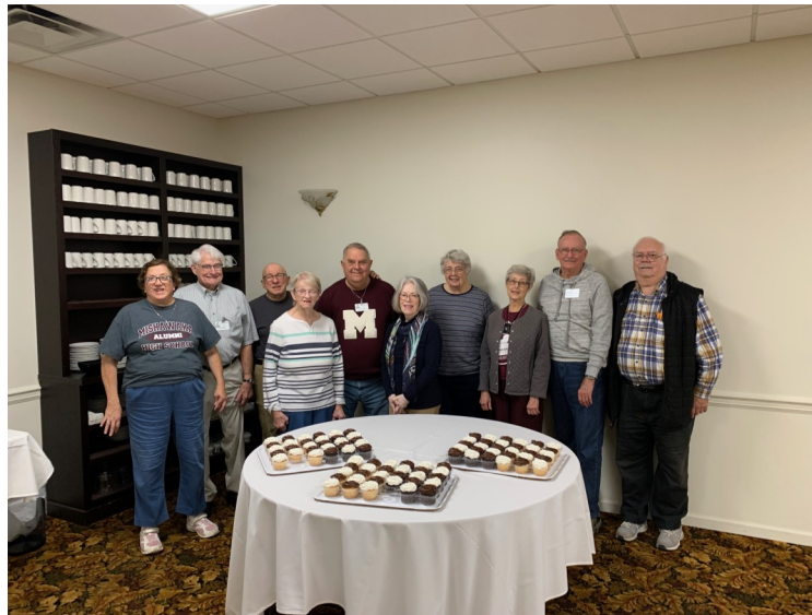
Ten birthdays in November! I think that's a record in attendance for the same month. Total number of birthdays in the association is 74.

If you are a VET.... I know that the membership form asks for information on you if you are a Vet but in case you did not fill in that section, I am asking for it now. If you have family members that are/were Vets and graduated from MHS, I would like that information as well. I will need your Branch, Rank and what years you served. I will put out a sheet at the luncheon but for all others, feel free to call or email me. We are trying to collect this information on all veterans that graduated from Mishawaka High School so any assistance that you can provide, would be greatly appreciated.